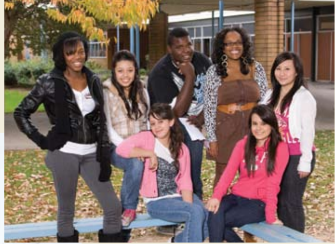
The Youth Action Team at Luther Burbank High School is a diverse group of students who meet regularly to research, identify and advocate for positive changes in their school. The team is supported by the Sacramento ACT Meadowview Partnership.

of family support services, school counselor, etc). 19 In the majority of REACH communities, coalition funds were used to expand existing student services at schools. Coalitions benefited by gaining access to youth and to school resources, including facilities, staff, data and community legitimacy. Schools gained partners to advocate for funding in the political arena, and community coalitions gain powerful institutional allies as they pursue more funding for youth development programs.